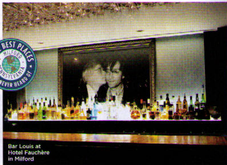
Bar Louis at Hotel Fauchère in Milford